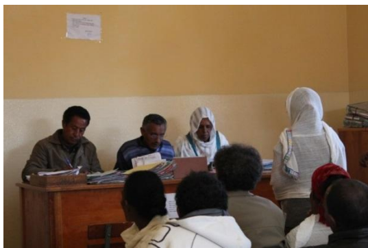
A Community Court in Asmara